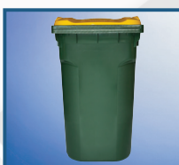
Greater capacity in a Kompakt footprint