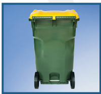
Easy grip handles for maximum comfort