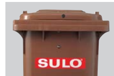
triangular lid lock