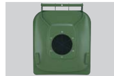
aperture for recycling 200 mm