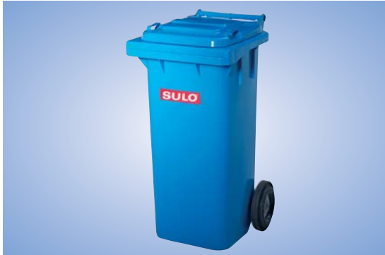
MGB 80 Kompakt

SULO accessories are proven through their superior quality and attention to detail. With a choice of five basic models, and so many accessories you are sure to find a container that meets your individual requirements.