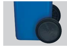
wheels 250 mm