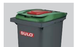
lid within a lid