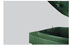
triangular lid lock