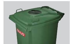
aperture for recycling 200 mm