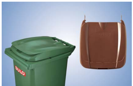
EURO 2 lid (optional)