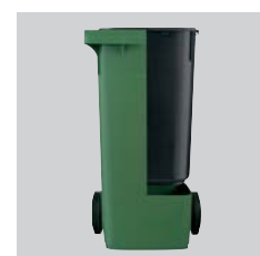
80litres square insert