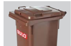
triangular lid lock