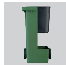
60litres square insert