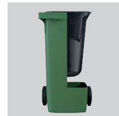
50litres round insert