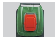
lid within a lid