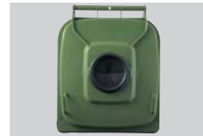
aperture for recycling 150 mm