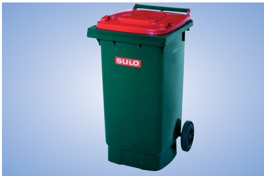
MGB 140 Kompakt