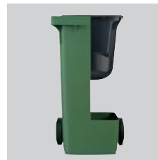
40litres round insert