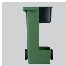
35litres square insert