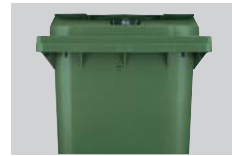
triangular lid lock