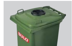
aperture for recycling 150 mm