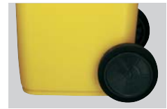
wheels 250 mm